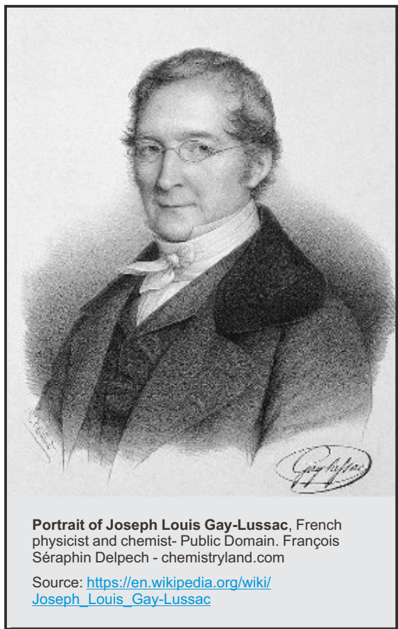
Portrait of Joseph Louis Gay-Lussac, French physicist and chemist- Public Domain.

for impeccable logic which Dalton enjoyed, there were, soon, some serious challenges to his table of atomic weights.