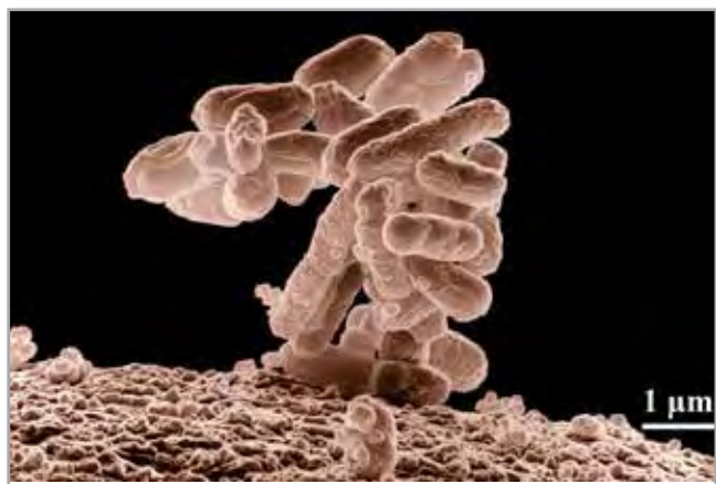
Figure 1. An electron micrograph of a cluster of E. coli , magnified 10,000 times.

One of the most significant benefits we derive from resident gut microbiota is that these microbes act as a defensive barrier against potential pathogens. They do this through a variety of mechanisms, one of which involves the production of antimicrobial substances that are active against several intestinal pathogens. For example, Lactobacillus and Bifidobacterium spp. produce antibacterial substances active against a wide range of pathogens including entero-pathogenic E. coli , and Listeria monocytogenes , etc. Other mechanisms used by gut bacteria to prevent pathogen colonization include impairment of flagellar motility and prevention of cellular damage in the host.